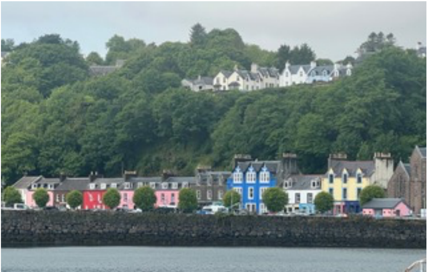
Tobermory on the Isle of Mull