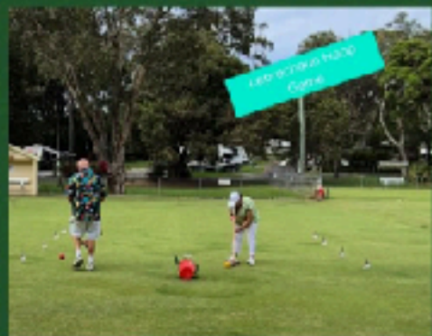
Let's play a game